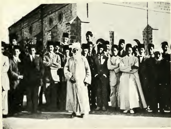
ABDUL BAHÁ AND A GROUP OF BAHÁIS AT THE TOMB OF THE Báb